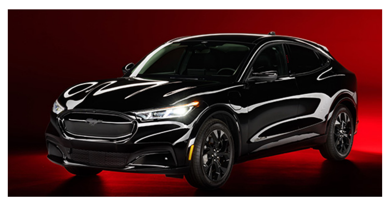
Fans Named It: See the Newest Mustang Appearance Package With nearly 29,000 suggestions overall, the voting results are in. The Nite Pony Package is now available for customers to order on the Mustang Mach-E and Mustang coupe and convertible.