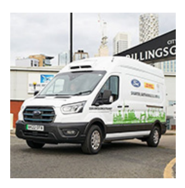
How Ford Pro is Making Fish and Chips More Sustainable The delivery trial explores ways to reduce