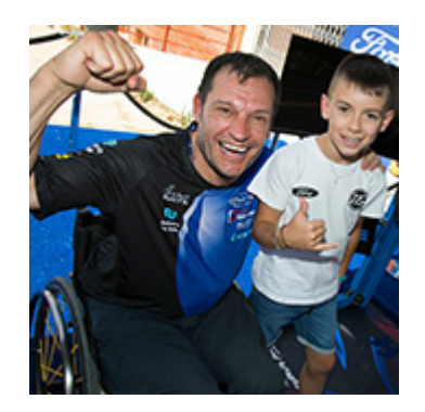
Virtual Meets Reality as Ford Adapta Simulator Goes Rally-Raiding in Spain The simulator was taken to the start of the