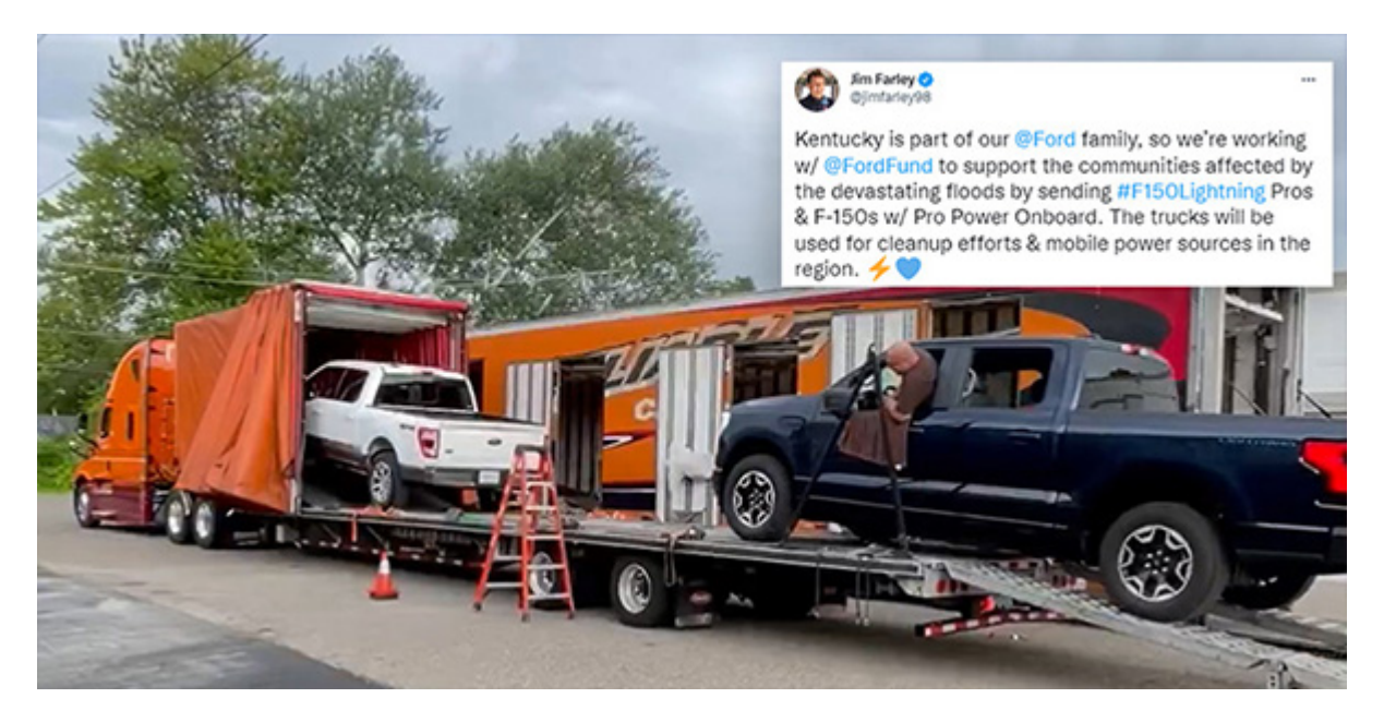
Ford F-150 Lightnings Aid Emergency Response to Kentucky Flooding Ford and its philanthropic organization, the Ford Fund, have taken quick action to help bring aid to Kentucky communities affected by devastating floods.