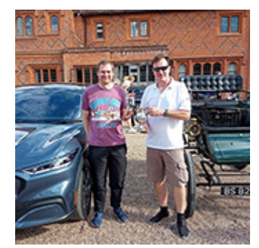
Mustang Mach-E Drives Off with Fuel Economy Cup A Ford Mustang Mach-E showed what it is capable of in expert