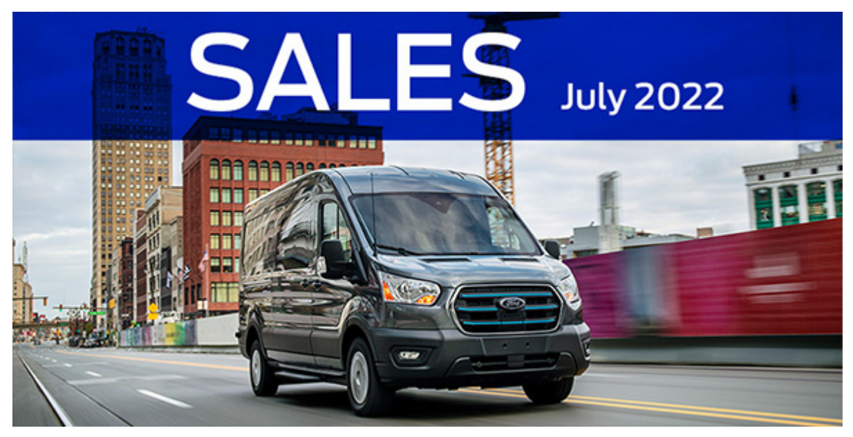
Ford Reports July U.S. Sales Ford was America's No. 1 brand in July with EV sales outpacing the rest of the segment, while F-Series was the No. 1 Truck.