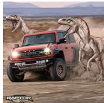
Ford Bronco Raptor