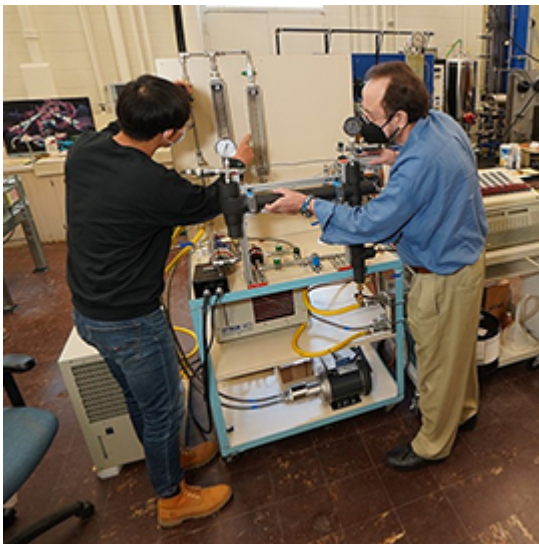
Detroit Free Press Highlights Ford Research Leaders, Innovations and Partnering