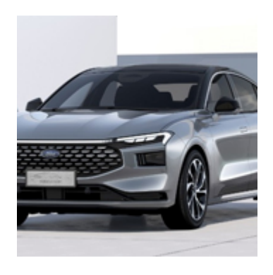
A Smarter Sportier All-New Mondeo is the