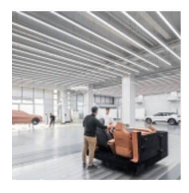
Ford Launches China Design Center in