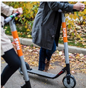
Spin and TIER Join Forces to Become