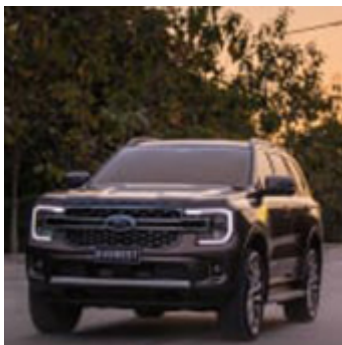
Next-Generation Ford Everest Is Bold