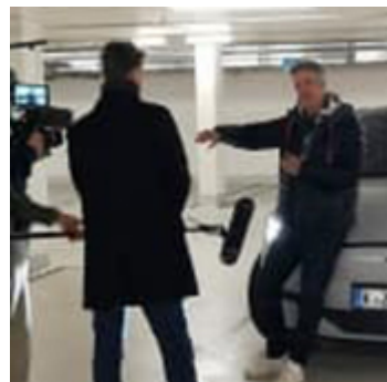
VIDEO: From Cologne to Berlin in a Mustang