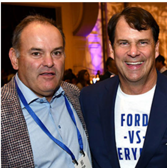
Ford and Dealers Join Forces to Invest, Grow and Focus on